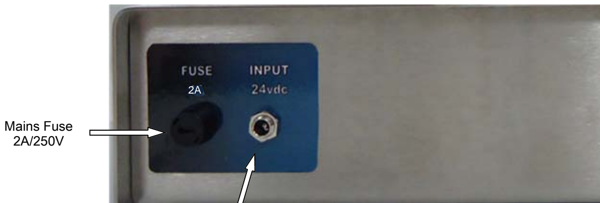
Figure 1—Rear View